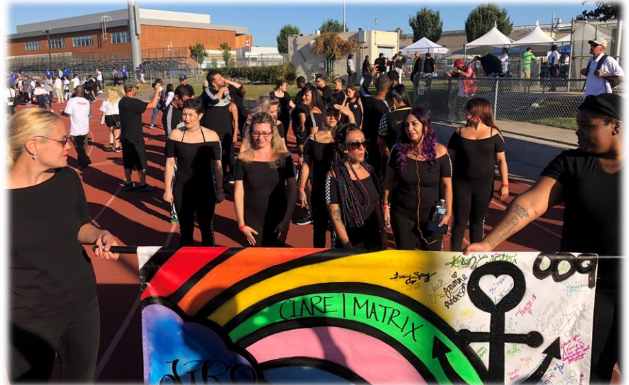
CLARE | MATRIX at Al-Impics in 2018