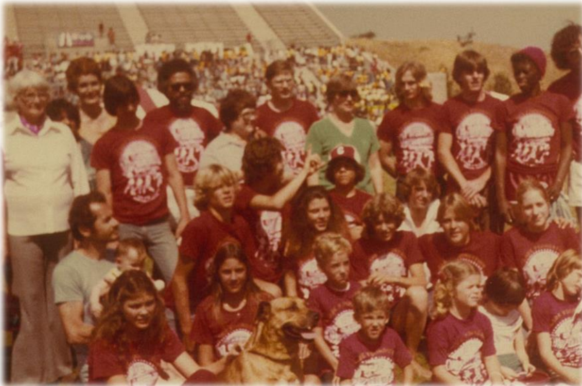
CLARE Foundation at Al-Impics in the 1970's

Join us in transforming lives Then & Now 2021